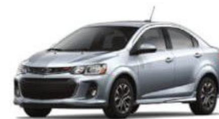
Bright Silver Metallic (GAN)