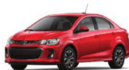
Red Solid (GG2)

✓ Vehicle comes equipped with feature | Features may vary based on market specification