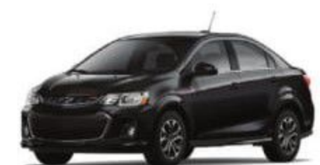
Black Carbon Metallic (GB0)