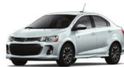
White Metallic (GP5)